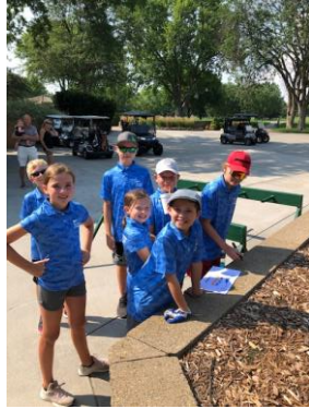
The Adults vs Parents Jr. Scramble was held on July 17 th and the Jr's beat the Adults!

All of the tee sheets, results, and player statistics will be listed on golfgenius.com . Go to the schedule of events page and click on the golf genius link and it will take you to the tee sheets and results.